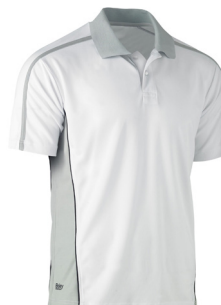
BK1423 PAINTER'S CONTRAST POLO SHIRT SS