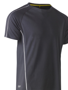
BK1426 COOL MESH TEE