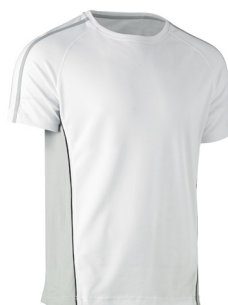
BK1424 PAINTER'S CONTRAST TEE